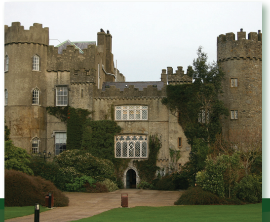
Malahide Castle, County Dublin