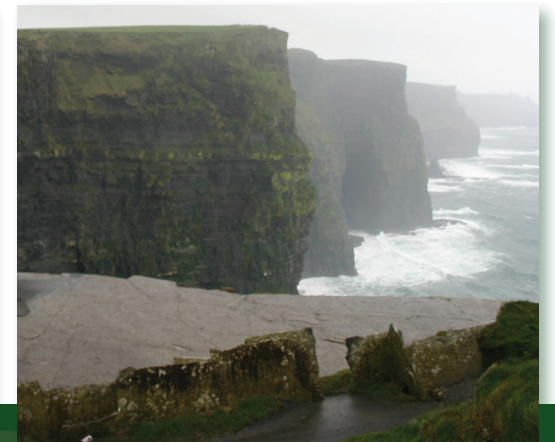
The Cliffs of Moher, County Clare