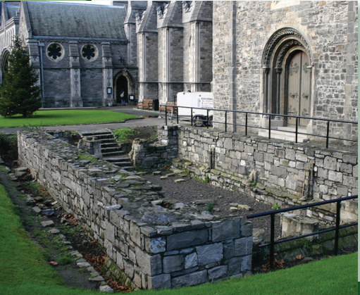
Christ Church Cathedral Dublin